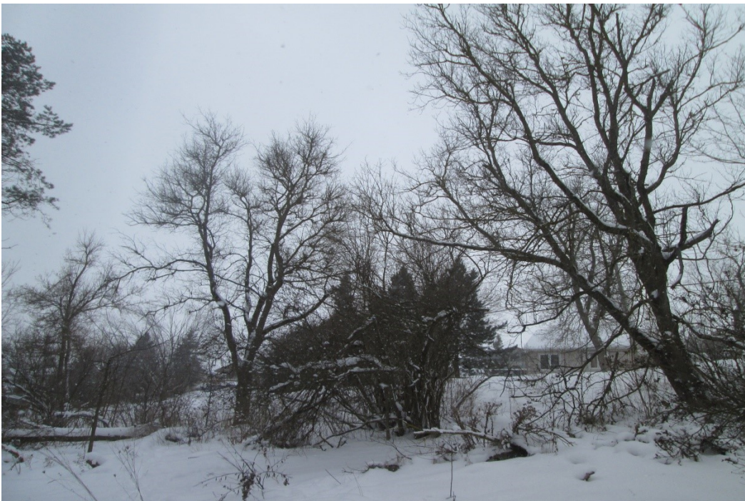
Photo 2: Looking west toward Crozier Street at hedgerow trees (Polygon B)