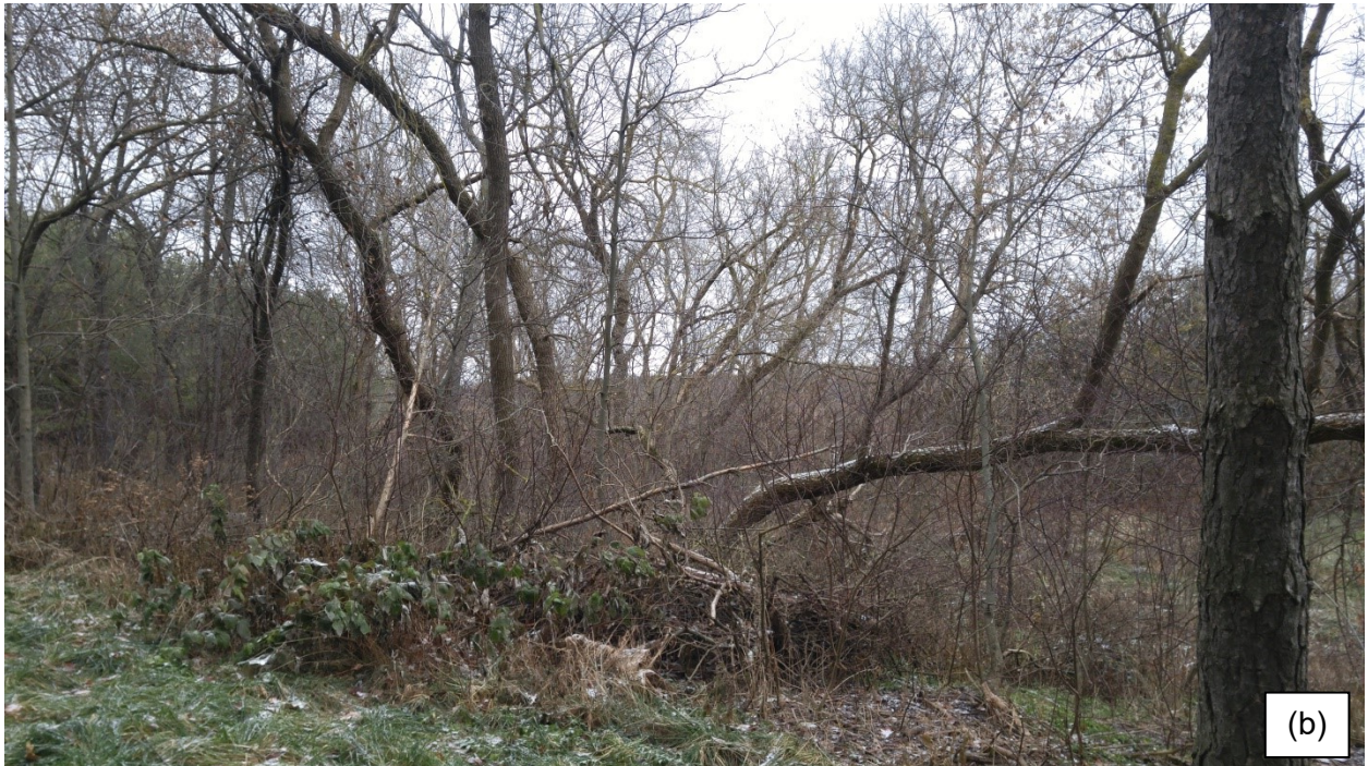
Photo 7 (a) and (b): Manitoba Maple-Black Cherry woodland (Polygon F)