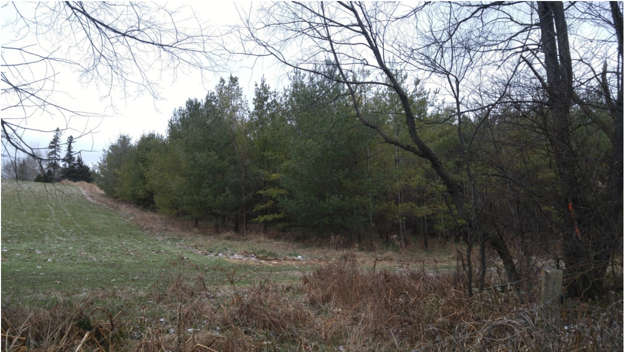
Photo 6: Eastern White Pine plantation, at southwest corner (Polygon H)